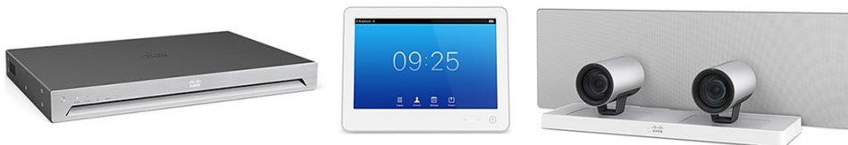
Figure 2. Cisco TelePresence SX80 Integrator Package with Touch 10 and SpeakerTrack 60

With its powerful media engine, the SX80 Codec lets you build the video collaboration room of your dreams.